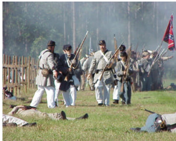
CSMC at Battle of Horse Landing 2004

The Marines of the South were the foundation of the Marine Corps we know today.